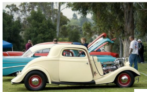
STAFF FILE PHOTO