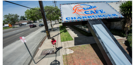
'Devil winds' cause fires, power outages